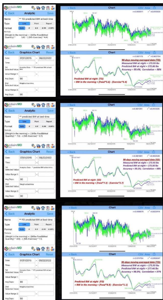
Figure 2: 3 BW at bedtime (predicted versus measured).

Figure 3 displays a comparison diagram of food energy %, exercise energy %, and prediction accuracy %, using 3 different methods, TD, SD, and FD.