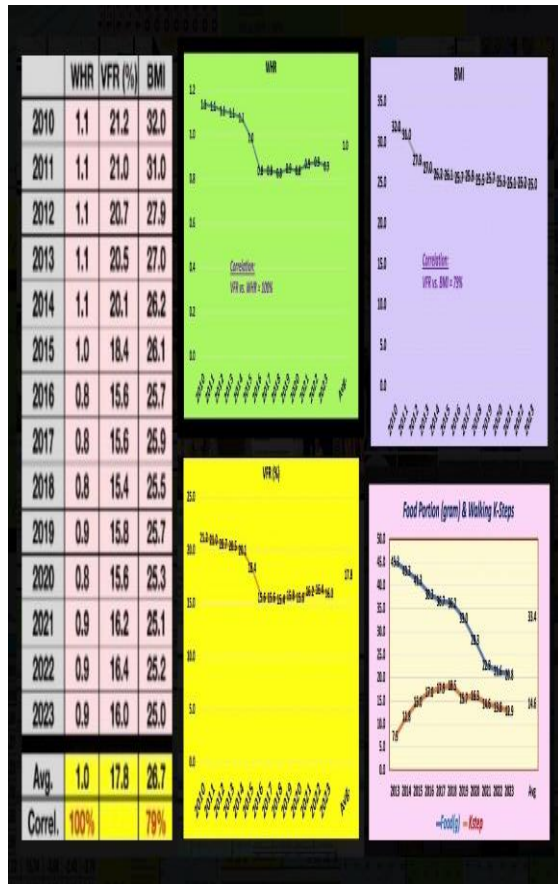
Figure 1: Three biomarkers, including visceral fat ratio.

Figure 1 shows three biomarkers, including the visceral fat ratio. Figure 2 shows the data table and SD-VMT energy diagram.